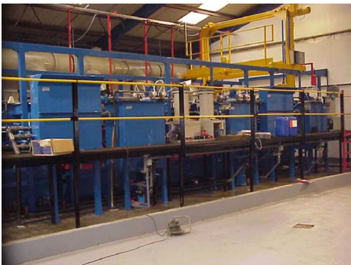
Auto dosing and filtration for both Acid and Alkali Zinc solutions on the plant