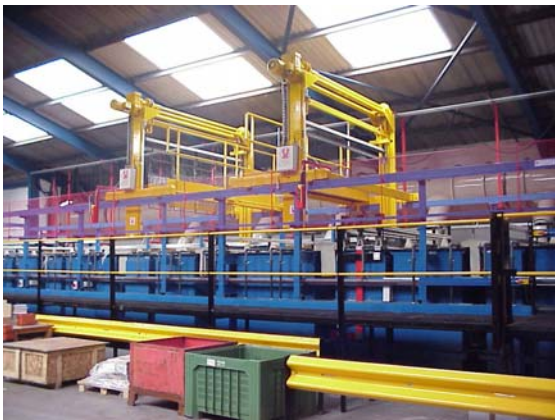
Two photo's showing the plant as it was originally installed on the customers shop floor

The plant consists of 36 stations made up of 3 double zinc plating stations, 2 acid and 2 passivate stations Electro and soak cleaners and a double gas heated dryer unit, 13 off flight bars, and 3 transporters. All as per our process schedule E2009SCD and layout drawing enclosed.