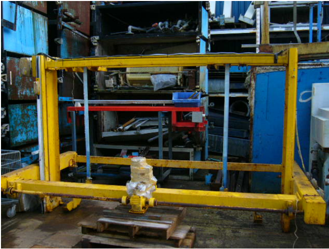
Transporter and tanks shown in our yard.

All as per our process schedule E2056SCD and layout drawing enclosed.