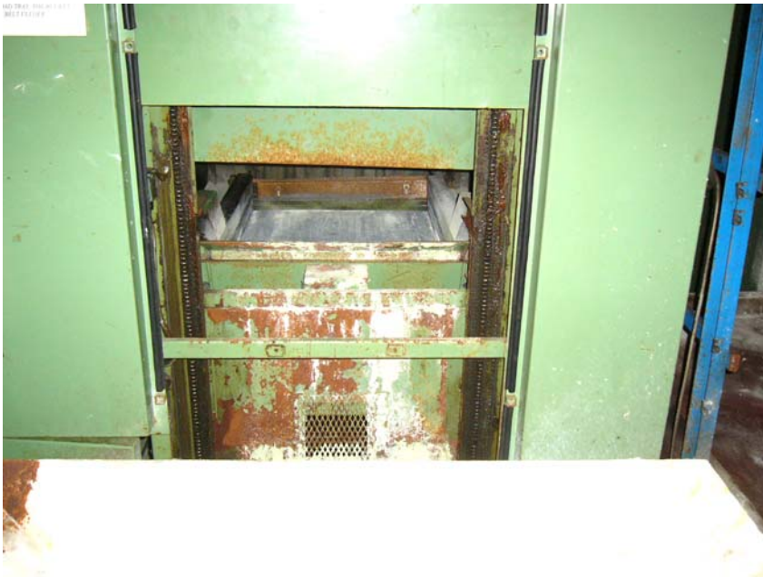
Above and right shows the Auto loader, controlled via the plant PLC