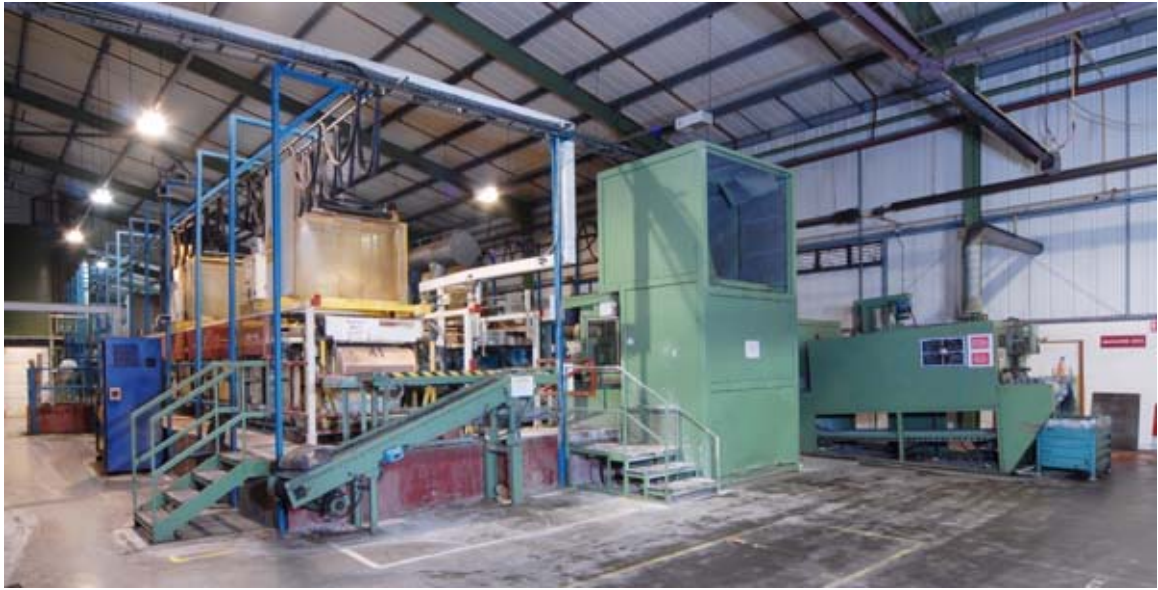
One of the ten 1,000mm barrels on the plant